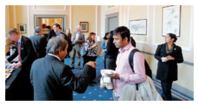
Networking Cocktail at Zero Carbon Energy - The Future, Edinburgh

The workshop was co-organised with the European Parliament Intergroup on Climate Change, Biodiversity and Sustainable Development and brought together European policy-makers, the chemical sector, the academic world and civil society in order to discuss the opportunities of turning waste into fuels, basic chemicals, polymers, and even fine chemicals and pharmaceuticals. More on this workshop can be found at http://www.euchems.eu/?p=667.