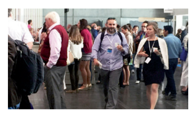
18th EuroAnalysis, September 2015, Bordeaux