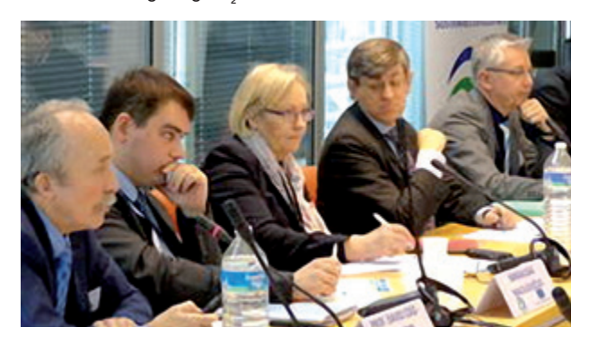
Panel of Integrating \mathrm{CO}_{\scriptscriptstyle 2} in the Value Chain