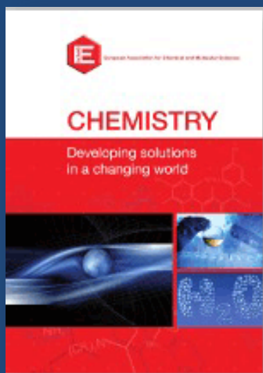
Developing solutions in a changing world EuCheMS Roadmap