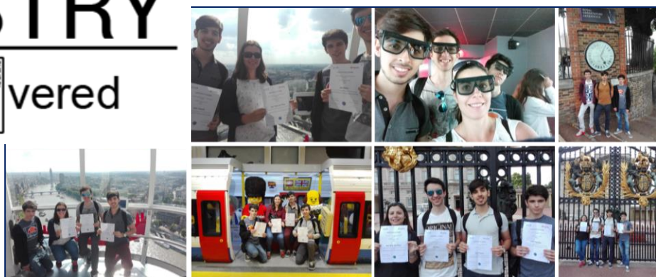
The winners of the 1 st Edition of Chemistry Rediscovered in 2016 from Portugal, on their victory trip to London!

Join us next year in celebrating one of the most significant events in the history of chemistry!