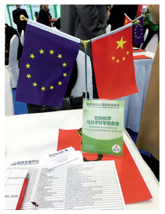
EuCheMS at a networking session during the mission to China

The scope of these missions was to deepen relationships and align policies on the circular economy between EU and these countries. With Chile being one of the strongest South American economies and China being the world's second biggest economy, the adoption of circular economy measures is both an economic opportunity and an environmental need.