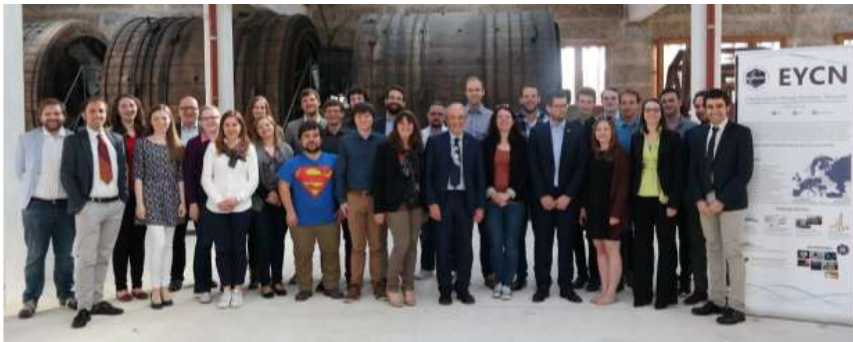
1st EYCC + 11th DA Guimarães, Portugal (2016)