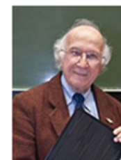
Dept. of Chemistry and Chemical Biology Cornell University eMail