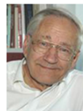
Laboratorium für Physikalische Chemie ETH Zürich eMail