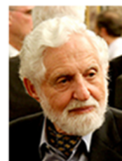
Department of Chemistry Stanford University eMail

Prof. Dr. Carl Djerassi Prof. Dr. Richard Ernst Prof. Dr. Roald Hoffmann