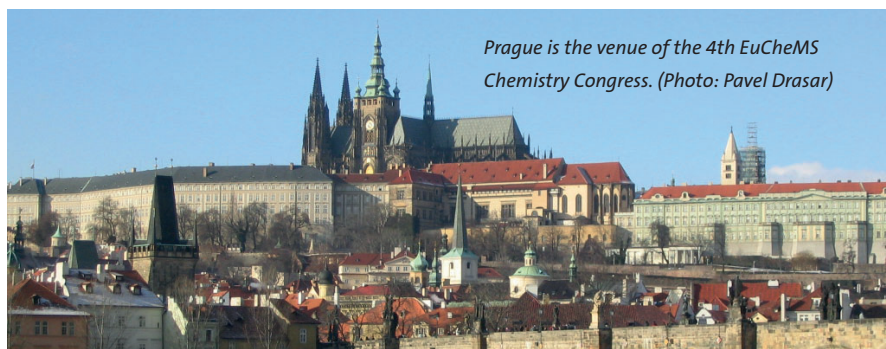
Prague is the venue of the 4th EuCheMS Chemistry Congress.

EuCheMS, the Czech Chemical Society and their institutional and business partners invite scientists of all chemical and related disciplines to join the 4th EuCheMS Chemistry Congress (4ECC), taking place in Prague, Czech Republic, August 26 to 30, 2012. We invite you not only to the Congress but to a fascinating destination. August in Prague and in whole Bohemia is still a part of the holiday season and many attractions and inexpensive options for travel and accommodation are therefore on offer. The organisers will do their best to let you experience valuable time interacting with colleagues from all over the world and we are sure you will enjoy the summer days in our fascinating capital of the Czech Republic.