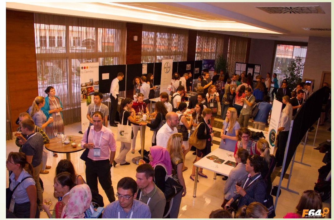
(Re)searching for Jobs?, Brussels, June 2015