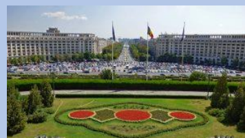
Bucharest Romania Square Free Picture, needpix.com