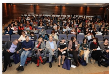
Annual chemistry teachers' meeting, December 2015

I was one of these women, explaining in the film the importance of science education, which spans borders and cultures, and advances humankind as a whole: "Learning science is an inseparable part of general education – not just a subject for future scientists, but knowledge that is crucial to all citizens of the globe who want to understand the world around them or even make rational choices in their lives. A broad education that includes science may not be the quickest route to economic success, but it is a sure one, and one that enriches the spirit of humanity. It is the essence of what makes us human".