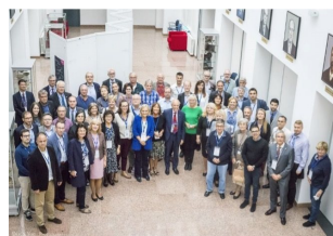
2019 EuChemS General Assembly, Bucharest, Romania