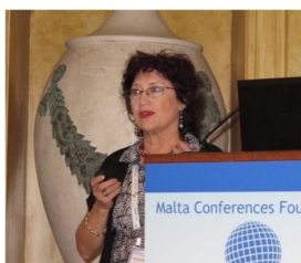
Malta conference, November 2016

I feel that my main achievements are in combining research and practice. I am happy that I had the opportunity to act as a chemistry teacher for 26 years, and to be able to conduct research studies in relation to teaching and learning chemistry.